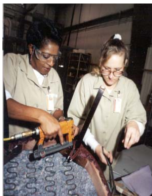
Inmates hard at work in the Upholstery Division

GCI and GDC work together for the greatest efficiency. One example is the cooperation in the production and shipping of inmate garments for Care and Custody, the warehousing and distribution arm of GDC. GCI and the Care and Custody warehouse are across the breezeway from each other at the Colony Farm Complex. In the spirit of cooperation, these two facilities were placed on the same property, offering the ultimate in speed and convenience of delivery.