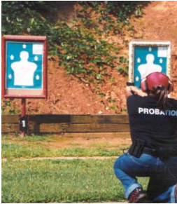
The Training Section at Work

Our Training Section, a part of the Human Resources Division, is responsible for training all employees of the department as well as employees of other organizations who work within our facilities. From the beginning of employment, the Training staff insures that employees are provided the training necessary to competently perform their jobs. The Training Section has over 100 full time employees working all across the state to meet this mission but the work would not get done without the numerous adjunct instructors who take time out of their regular jobs to help train.