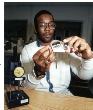
Shown above is an inmate working in the Optical Plant

GCI is an important part of GDC's efforts to reduce offender recidivism. Inmates learn valuable skills for use upon release. Having a legitimate means for earning an income is one of the prime preventors of someone returning to prison.