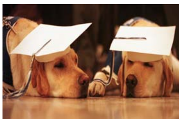
Joey and Traveler rest after receiving their diplomas!

Joey and Traveler (Left), exhausted from their strenuous training, are two of the dogs that graduated from guide dog training at Metro State Prison on August 26th. It was an exciting day as six dogs completed the first leg of their training toward the goal of being an invaluable assistant to a disabled person. Inmates assigned to the training program, as well as the dogs' weekend families, were responsible for socializing the dogs and teaching them basic commands. The dogs, provided by the non-profit organization Southeastern Guide Dog, Inc., not only helped inmates obtain valuable job skills but also provided a boost to employee morale.