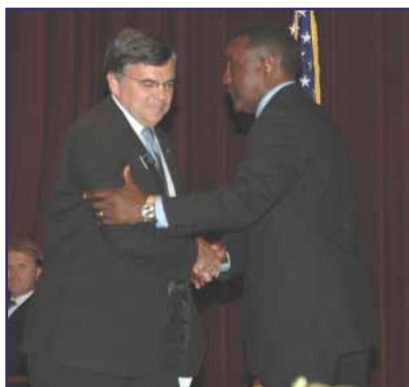
Senator Grant greeted by Commissioner Donald