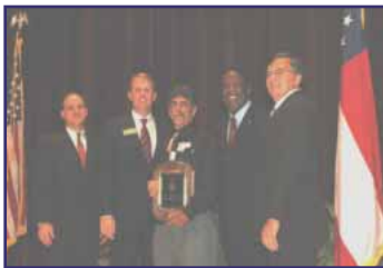
Rockdale Judicial Circuit Facility Fitness Award