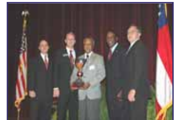
Atlantic Judicial Circuit Probation Circuit of the Year

The Center of the Year honors went to Women's Probation Detention Center .