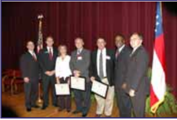
Faith Based Contributor of the Year Award Recipients

The Faith-Based Contributor of the Year Awards were presented to Deliverance Temple - Hancock SP, Heartbound Ministries - Metro SP, Miracle Prison Ministry - Burruss CTC and Victory Baptist Church - Augusta DC.