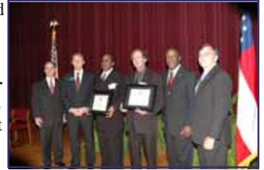
Partner Agency Award Recipients

The Faith-Based Contributor of the Year Awards were presented to Deliverance Temple - Hancock SP, Heartbound Ministries - Metro SP, Miracle Prison Ministry - Burruss CTC and Victory Baptist Church - Augusta DC.