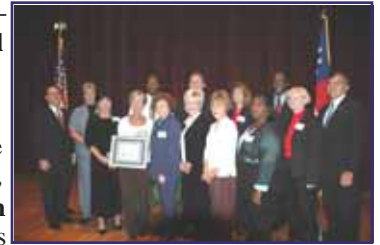
Baldwin SP Care & Treatment Staff PERW Award Recipients

The Corporate Sponsor of the Year Awards were presented to Bob's IGA - Thomasville DC, Cagles Inc - LaGrange TC, Evans Ace Hardware - LaGrange TC, Fuller E. Callaway Foundation - LaGrange TC, Jerome Personnel/Business Temps - Augusta DC, Kann Enterprises - Albany TC, Macuch Steel Products - Augusta DC and New Ventures Inc. - LaGrange TC.