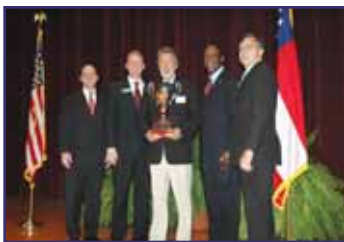
Womens P.D.C. Center of the Year

The Facility of the Year honors went to Lee Arrendale State Prison .