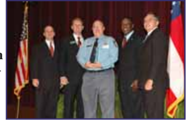
John C. Clanton James Henderson Award