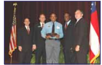
Melvin Womble Individual Fitness Award