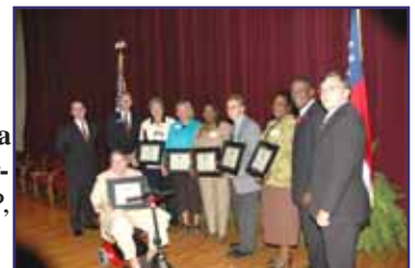
Volunteer of the Year Award Recipients

The County Facility of the Year honors went to Muscogee County Prison .