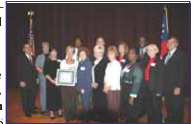
Baldwin SP Care & Treatment Staff PERW Award Recipients

The Corporate Sponsor of the Year Awards were presented to Bob's IGA - Thomasville DC, Cagles Inc - LaGrange TC, Evans Ace Hardware - LaGrange TC, Fuller E. Callaway Foundation - LaGrange TC, Jerome Personnel/Business Temps - Augusta DC, Kann Enterprises - Albany TC, Macuch Steel Products - Augusta DC and New Ventures Inc. - LaGrange TC.