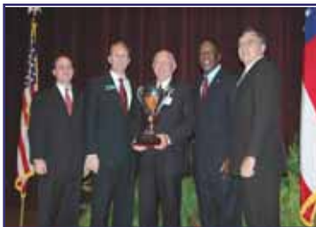
Muscogee County Prison Facility of the Year

The Probation Circuit of the Year honors went to the Atlantic Judicial Circuit .