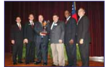
Lee Arrendale State Prison Facility of the Year

The Facility Fitness Award honors went to the Rockdale Judicial Circuit .