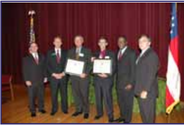
Corporate Sponsor of the Year Award Recipients

The Partner Agency Awards were presented to Clayton Regional Career Center - Georgia Department of Labor and Macon Vocational Rehabilitation Center - Georgia Department of Labor.