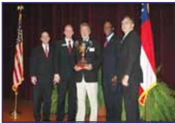
Womens P.D.C. Center of the Year

The Facility of the Year honors went to Lee Arrendale State Prison .