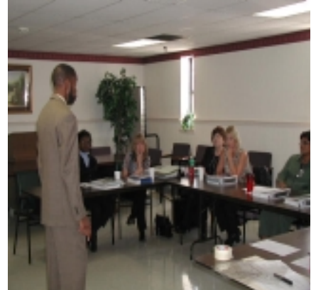
DOC employees receive training as R&R coaches

The Prime for Life program, introduced this month as a possible replacement for Substance Abuse 101, will be piloted at 11 sites around the state. Twenty staff from these sites completed the training at GPSTC on April 11, 2002 and will conduct the first groups in July. This program utilizes the same curriculum that the DUI schools have used with proven success in our communities.