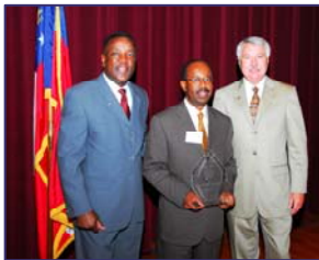
Robert L. Brown, Jr. Legacy Award