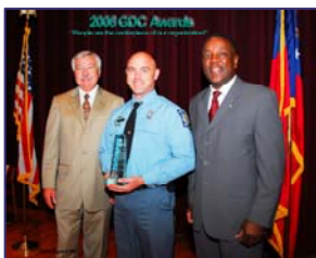
Sherman Maine James Henderson Award