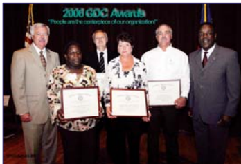
Partner Agency Award Recipients