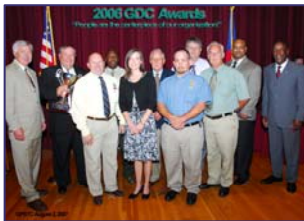
Douglas Judicial Circuit Probation Circuit of the Year

The County Facility of the Year honors went to Bulloch County Correctional Institute .