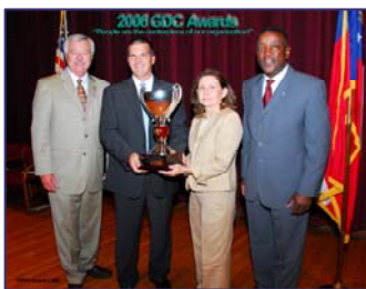
Bacon Probation Detention Center Center of the Year

The Facility of the Year honors went to the Georgia Diagnostic & Classification Prison .